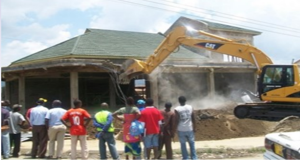
The excavator in the process of demolition of the houses at Kimara

Ubungu, Dar es Salaam land eviction that is triggered by extension of Morogoro road has been reported severally to have been carried out without abiding by legal procedures in place. In media reports and information obtained from the victims the said eviction was conducted despite of a court order that required TANROADS to