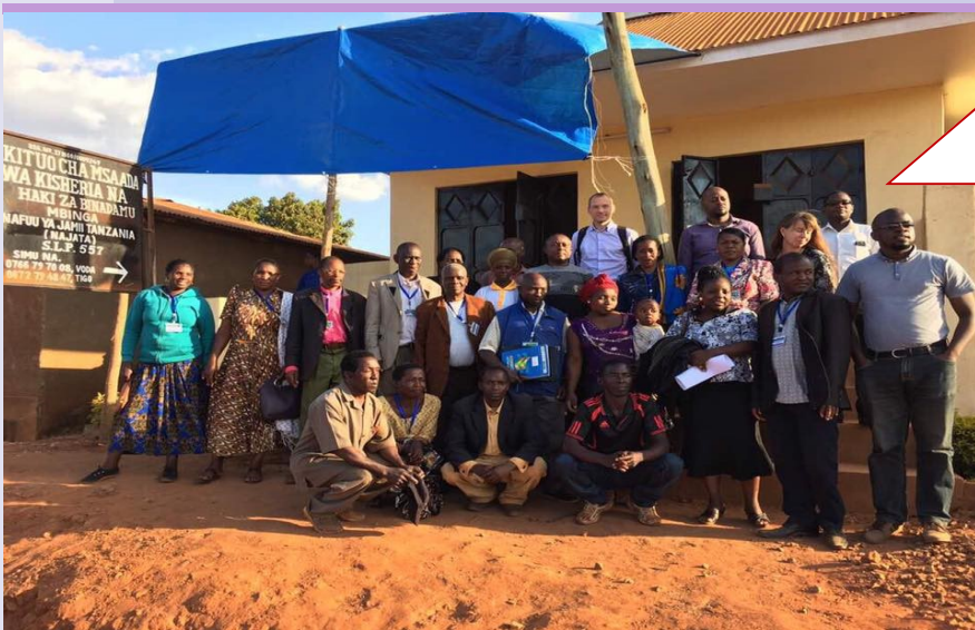
The team from LHRC, Norwegian Embassy & Swedish Embassy in a group photo with Mbinga paralegals

LHRC has two model legal aid clinics, one in Kinondoni, Dar es Salaam and another in Arusha. The Centre conducts mobile legal aid clinic to reach out to the people who cannot access the service from the said two clinics.