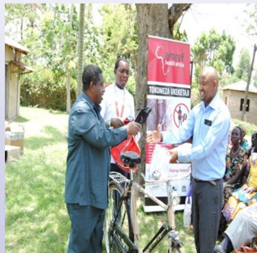
Serengeti District Commissioner gives one of bicycles to the district medical officer

LHRC in collaboration with Amref Health Africa has given away bicycles to 84 (52 female: 32 male) community health workers. Bicycles were proposed to be the paramount equipment to facilitate movements of health workers in remote areas especially house hold sensitization and awareness rising in the communities.