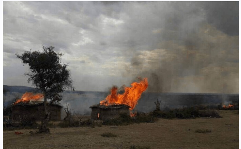
A snapshot of houses set afire during Loliondo eviction

In its moves to attain the citizen centered constitution, LHRC has continued to identify and engage strategic partners for the constitutional reform movement. One of the engagements that LHRC embark is an official visit to the Tanzania Law Reform Commission aiming at making a follow-up on the steps that has been taken by the commission on the amendment of laws including the Constitutional Review process laws.