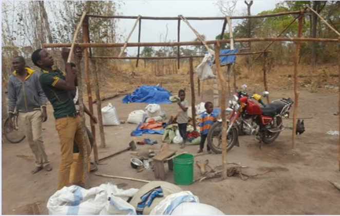
One of victims of land eviction at Bujombe village in Tanganyika District, Katavi establishes a temporal shelter

In response to the public outcry and an increase in cases of land eviction and land conflicts especially in areas neighboring wildlife conservation areas, along road reserves and farming regions, LHRC conducted several fact findings to unveil the truth and suggest the best redress measures.