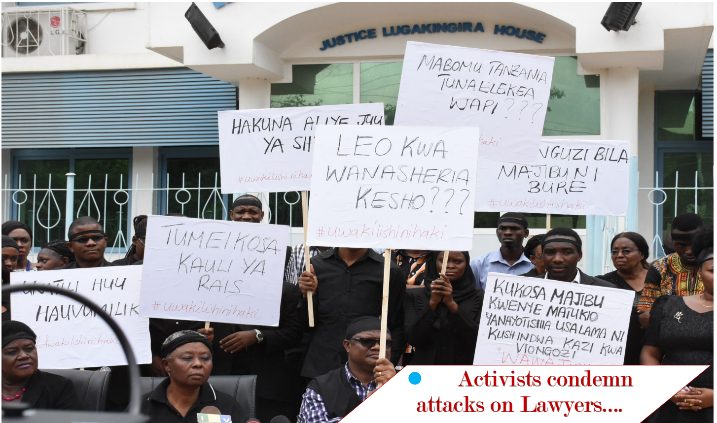
● Activists condemn attacks on Lawyers....