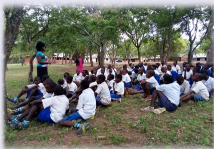
Nyamakobiti Anti-Female Genital Mutilation School Club in Serengeti take part in a dialogue

District Council and the traditional leaders. The said meetings were organized by leaders in charge of the clanship. The facilitators for these meetings were traditional leaders themselves and the local government officials who clarified and what was said by the traditional leaders.