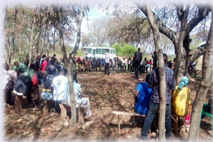
A snapshot of one of the village based mixed dialogue as captured at Kwitete Village in Serengeti

Alongside trainings and dialogues, LHRC organized public meetings gathering traditional leaders, circumcisers, local government leaders and the community to talk about war against FGM. Public meetings were convened as a result of the MOU signed by the Serengeti