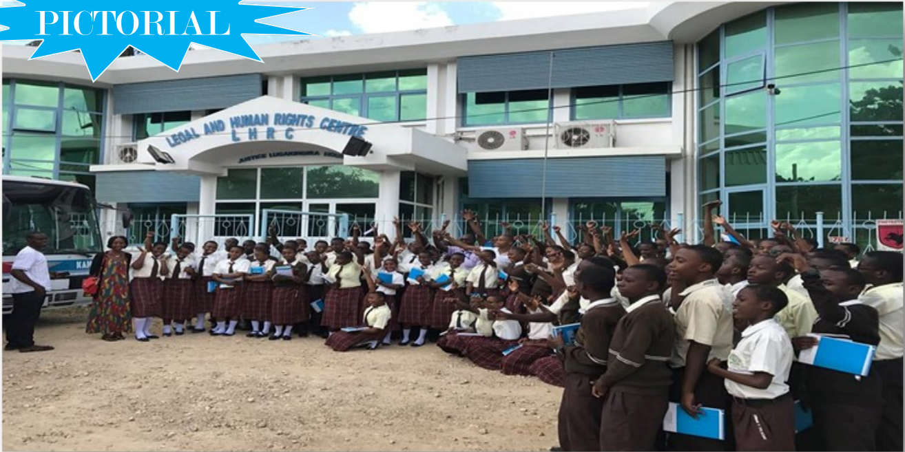
Students from St. Joseph Millennium Secondary School in Dar es Salaam in a group photo during their learning visit to the LHRC on 29 th July, 2017.